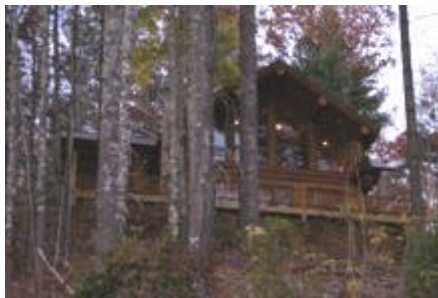
View from the cabin.